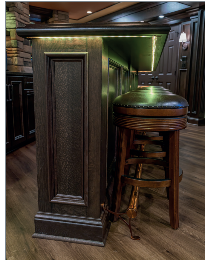
ABOVE: Custom woodworked bar with built-in LED lighting

To see more images and the full transformation video, please visit https://pghsw.com/handcrafted-entertainment-in-sewickley