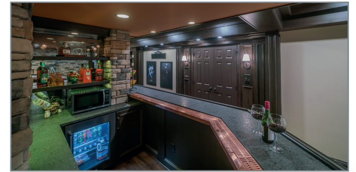
ABOVE: Custom bar and double door entrance to home theater