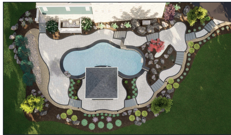
ABOVE: Photorealistic rendering of an outdoor living space

Another important feature of the BIM workflow is the ability to create detailed simulations and analysis. The BIM workflow allows architects and designers to create simulations and analysis of a building's design. For instance, designers can create