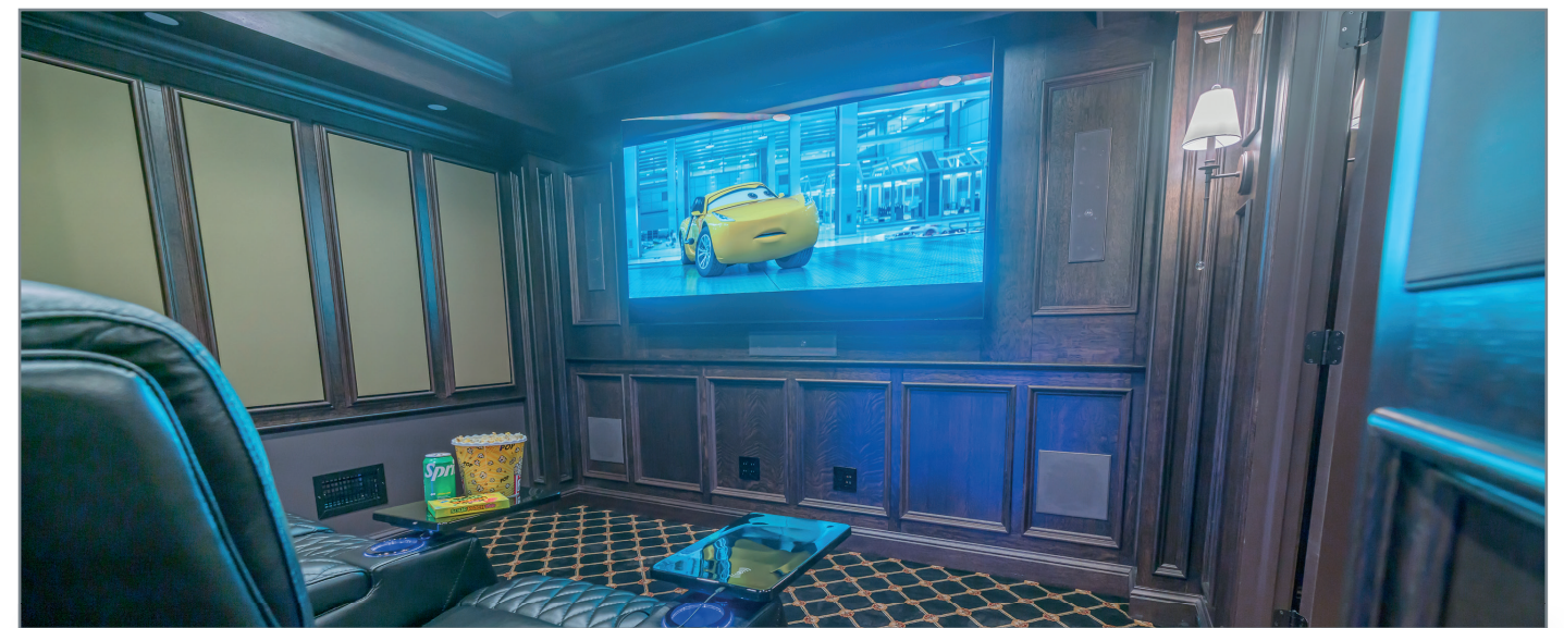
ABOVE: Custom home theater with built-in surround sound