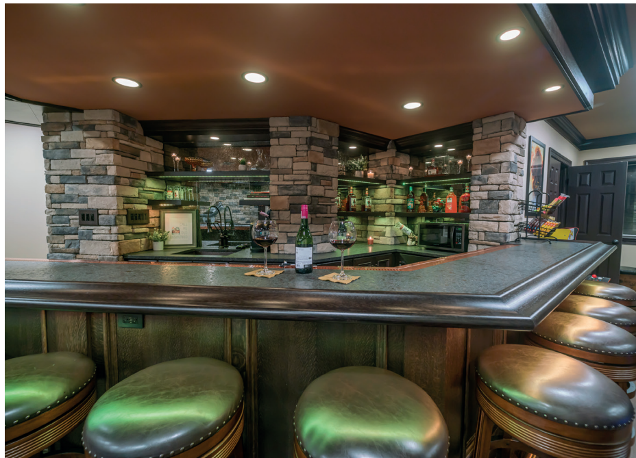
ABOVE: Custom bar with copper railing

The result includes beautifully crafted woodwork, custom materials, and the latest technology to provide the family with the functional finished basement that they love and use daily. According to the homeowner, the kids are always down there watching movies and playing games, the husband has converted a small area into a makeshift home office, and both parents enjoy the bar and the theater room in the evenings. The