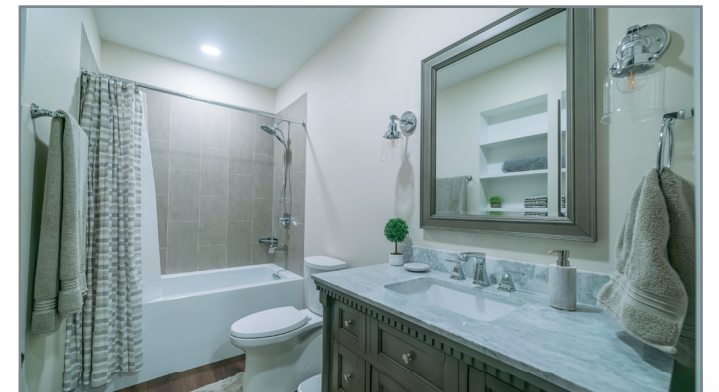
ABOVE: Full bathroom