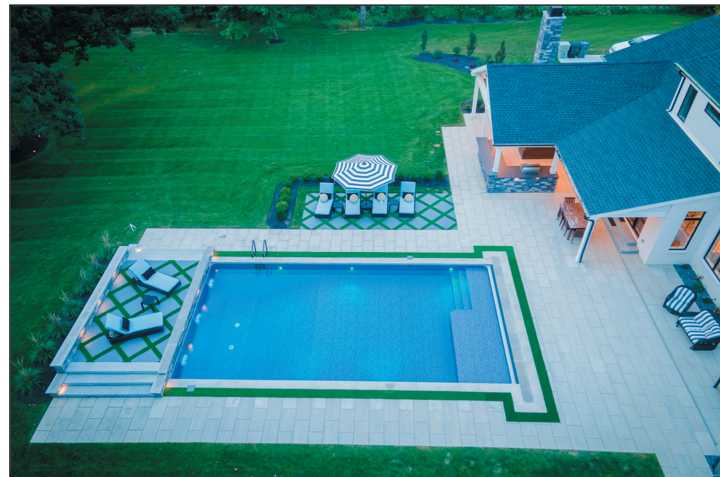
ABOVE: Completed living space with Californian feel

“If you want someone who is going to do it right the first time, who is going to do it with a lot of care and quality, and who is going to be there for you and communicate every step of the way, you're going to want to go with PSW.”